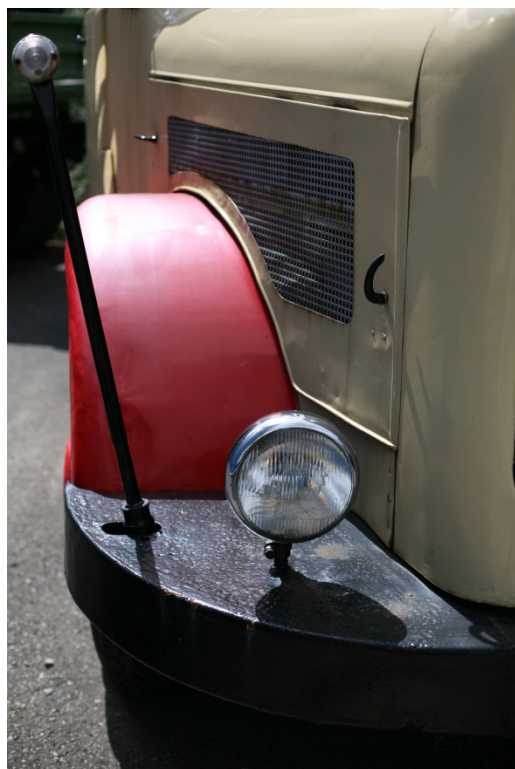
Without ZEISS T* POL Filter

Circular POL Filters avoid problems with exposure metering and AF systems of (D)SLR camera bodies that might occur with linear POL filters.