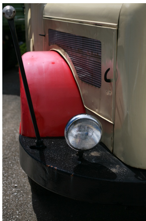
With ZEISS T* POL Filter